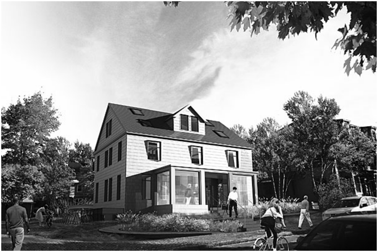
Harvard's Graduate School of Design (GSD) will transform this stick-frame house, which predates the 1940s, into an energy-efficient headquarters and lab space for its Center for Green Buildings and Cities.

GAZETTE: Switching gears to the project itself, what was the genesis of the HouseZero effort?