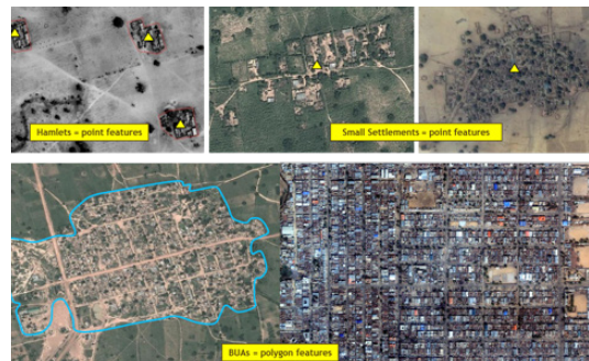
Image 1: High-Resolution Imagery Helped Create More Accurate Population Estimates in Northern Nigeria

No single approach to measurement would have been capable of meeting decision support needs. Field surveys were too slow and prone to error. High-resolution imagery could detect structures but not generate estimates of populations. By combining these two sources of information, along with other data such as road networks and land cover maps, it was possible to generate highly accurate estimates of population distribution in less than three months. These new estimates were instrumental in the effort to deliver vaccines where and when they were needed.