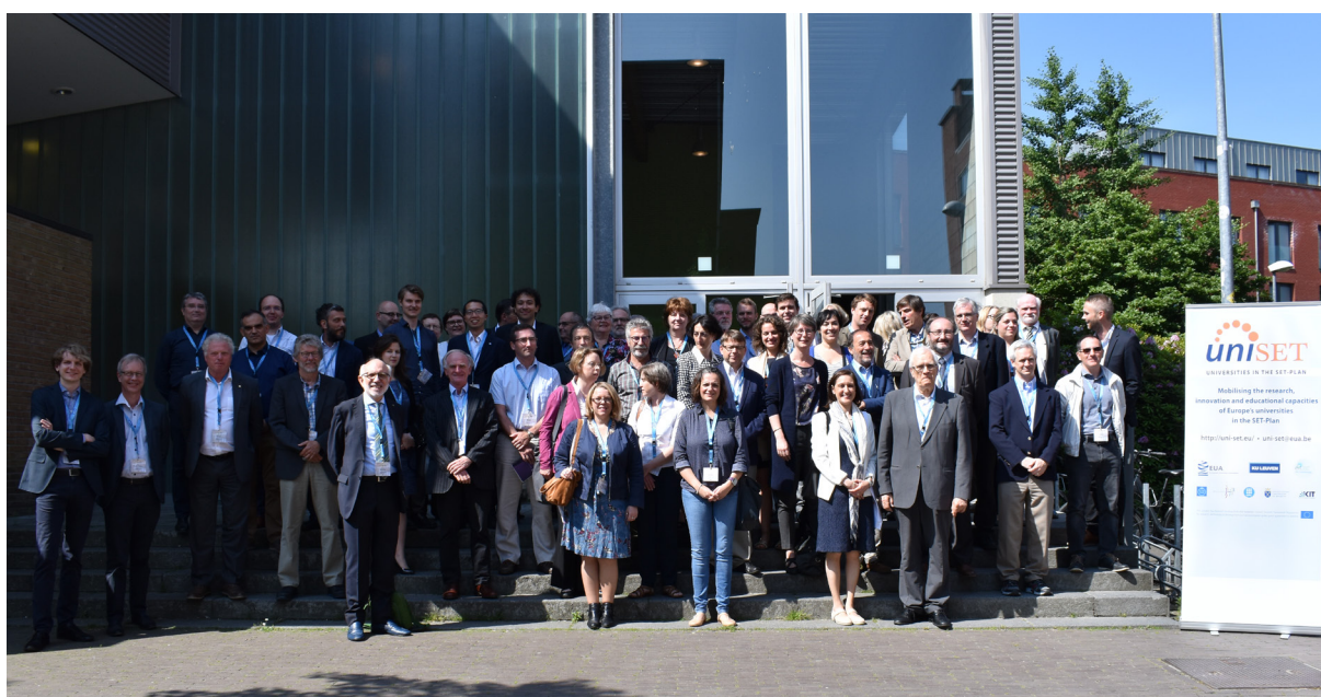
5th UNI-SET Energy Clustering Event