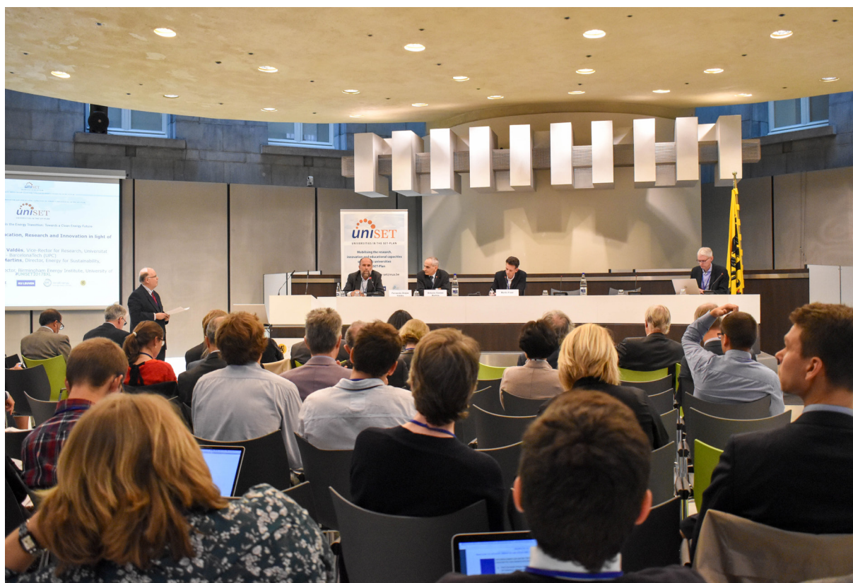
6 th UNI-SET Energy Clustering Event