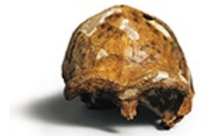
How China is rewriting the book on human origins