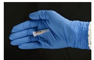
Oldest ancient-human DNA details dawn of Neanderthals

Their initial goal was to re-date the site using newer methods, but in the late 2000s, the team uncovered more than 20 new human bones relating to at least five individuals, including a remarkably complete jaw, skull fragments and stone tools. A team led by archaeological scientist Daniel Richter and archaeologist Shannon McPherron, also at the Max Planck Institute for Evolutionary Anthropology, dated the site and all the human remains found there to between 280,000 and 350,000 years old using two different methods.