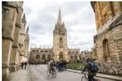
( student/best-universities/best-universities-uk )

Top 10 universities for producing Nobel prizewinners 2017 ( /news/top-10-universities-producing-nobel-prizewinners-2017 ) October 13, 2017