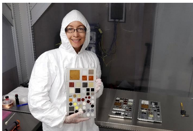
The PI in the cleanroom at Alpha Space in Houston holding the MISSE-9 ram experiment tray; the wake (left) and zenith (right) trays are on the bench.

MISSE-9 will expose materials in each flight orientation on the space station. This includes forward facing known as "ram," rear-facing known as "wake," space-facing known as "zenith," and Earth-facing, known as "nadir." Flying samples in each orientation will show how the varying atomic oxygen and solar exposures in each position affect material. More details in https://www.nasa.gov/feature/predicting-the-lifespan-of-materials-in-space .